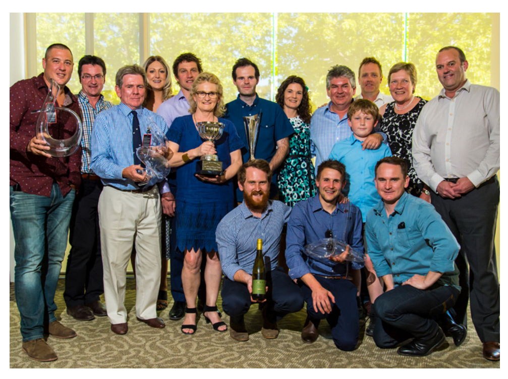
Pikes Wines - Jim Barry Trophy for Best Wine of Show