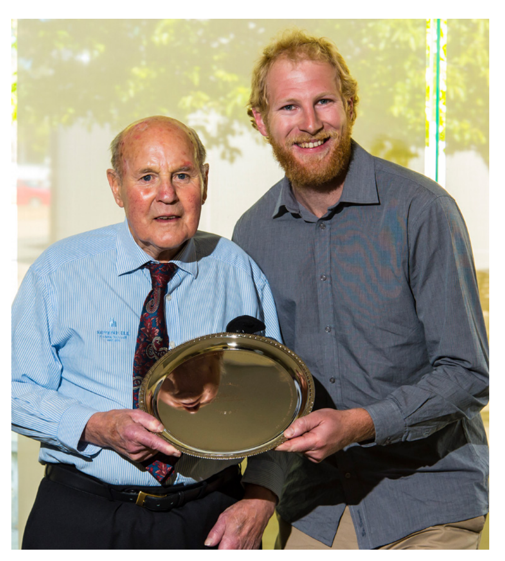
O'Leary Walker Wines - Wine of Provenance Award