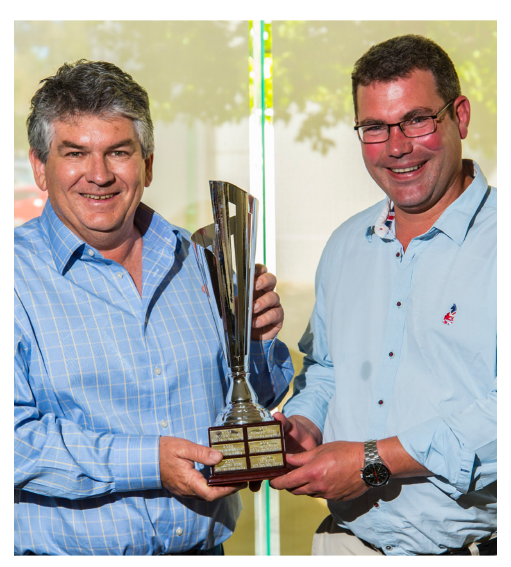
Pikes Wines - Mick Knappstein Trophy for Best Current Vintage Riesling